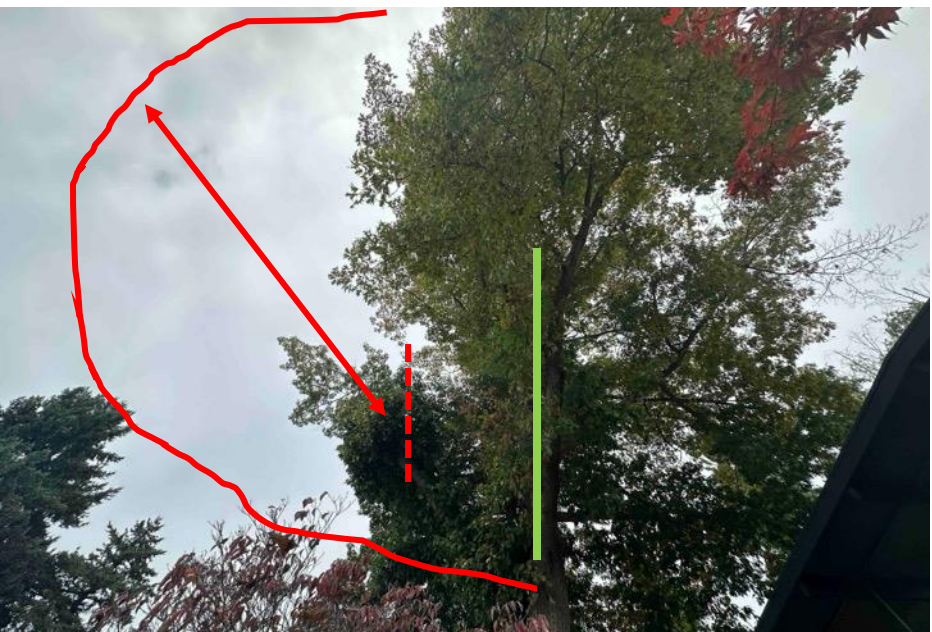
Photo 2: Red outline shows approximate area occupied by the topped stem. View is looking north. Image taken from the street. Red dashed line shows how far back the topped stem was cut. Arrow indicates the approximate distance from the trunk the stem was topped. Green line identifies the main trunk for reference.