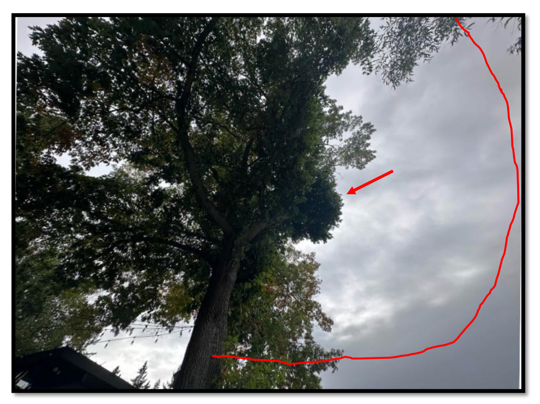
Photo 1: Red outline shows approximate area occupied by the topped stem. View is looking south. Image taken looking up from base of tree. Arrow points to end of stem that was topped close to the property line and is re-sprouting.